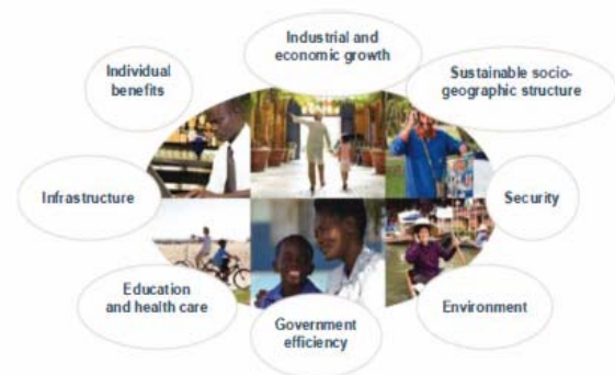
Fig.1. The Value of Mobile Communications

offers connectivity, or access which is the first step toward opportunity. Connectivity is only one component of ICT, which is considered that span the four Cs: computer (rather, devices), connectivity, content and (human) capacity. As shown in Fig. 1 mobile ICTs can enable a more obvious human development through efficiency, empowerment and opportunities. The capacity of these technologies to reduce many traditional obstacles, especially those of time and distance has the potential to benefit millions of people in all comers of the world.